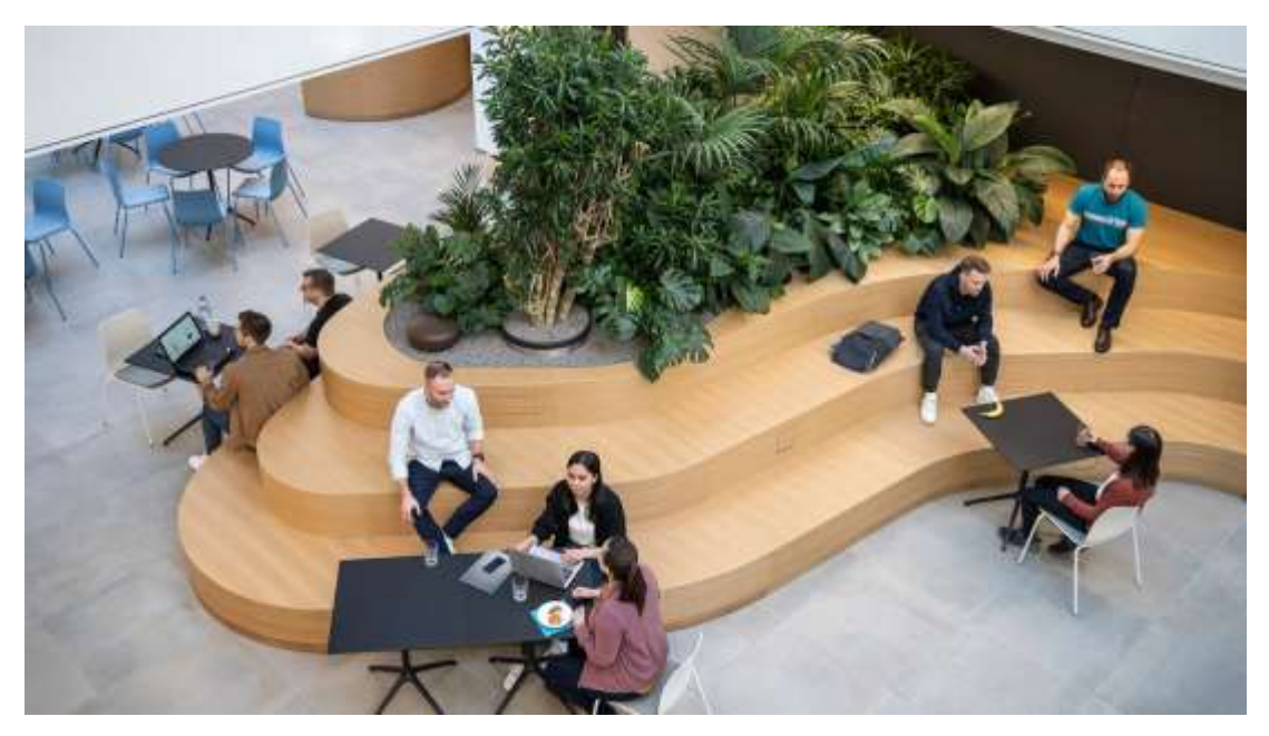
Teamwork and community spirit set the tone at doubleSlash Net-Business GmbH. These factors were decisive for the design of the new working environment in the software innovation center.

Friedrichshafen, Germany, June 27, 2022. The new software innovation center of doubleSlash Net-Business GmbH, a software developer and provider of IT services with headquarters in the German city of Friedrichshafen, demonstrates the features of future working environments. Social elements such as teamwork, community spirit and corporate identity set the tone for interior design. A well-being zone, a gaming corner, as well as a roof terrace with a movie theater and an outdoor kitchen, provide a place for occasional counterbalance. The heart of the building is the spacious atrium, which also opens up to the outside as a meeting space and provides space for digital innovation and exchange in the business region Lake Constance and surroundings. The Munich-based experts for working environments of Drees & Sommer SE, a consulting company specializing in construction and real estate, were in charge of the planning, design and realization of the interior work.