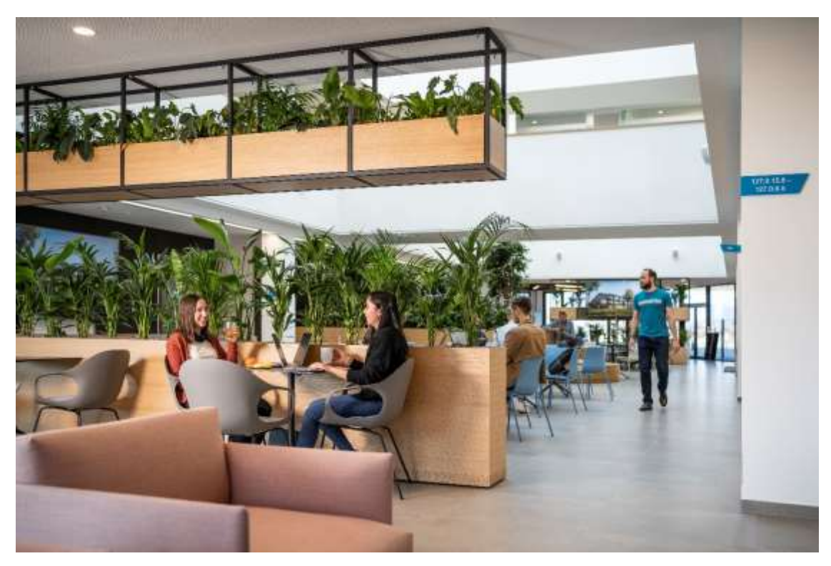
The large atrium is the heart of the building. It offers space for meetings, talks, discussions and events.

The focal point of the building and central venue for meeting is the spacious atrium. More than 120 plants acting as a zoning module provide a healthy interior climate and create a comfortable atmosphere. The open structure and high-quality technical equipment enable analog, digital and hybrid events to be held, all of which can be followed from anywhere in the atrium. The software innovation center remains an ideal place for regional networking and digital projects around Lake Constance as an economic center and beyond.