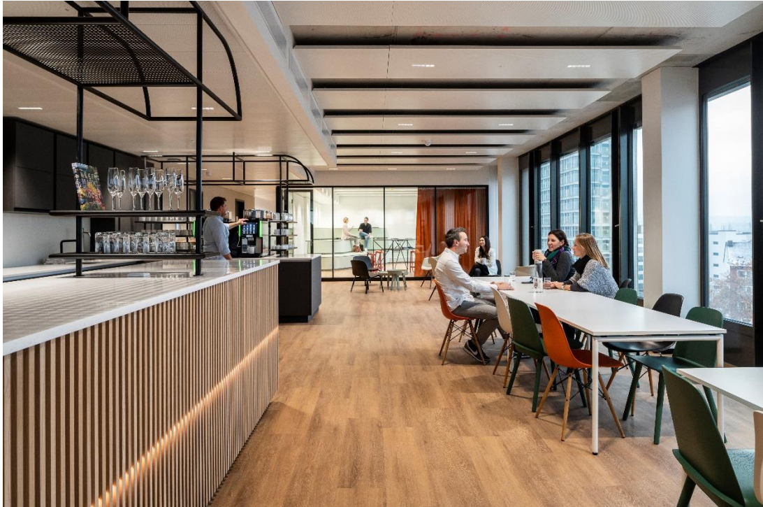
The marketplace on the top floor with its large kitchen serves as a central meeting place for breaks, for conversations every now and then, or as an event location.